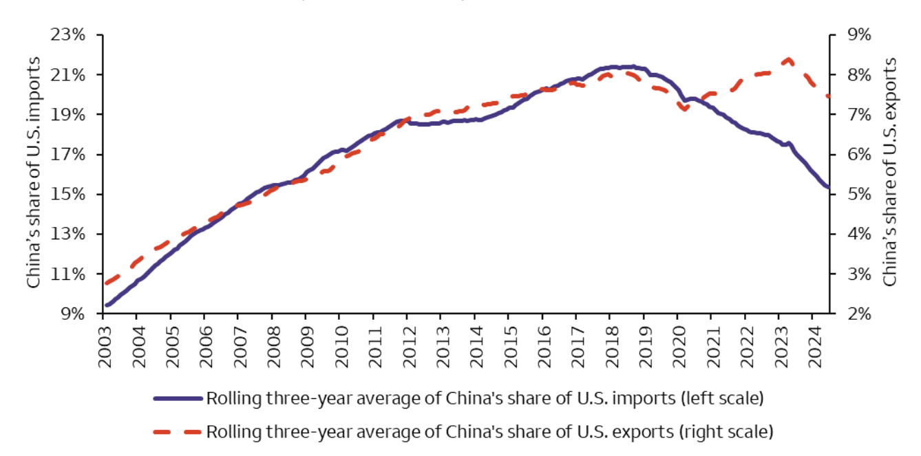
Chart 2. China-U.S. trade dependency has been declining